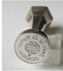
mARTin Art Collection (MAC)